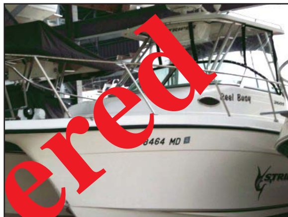
Vessel Name: “ Reel Busy ”

LOCATION OF INCIDENT: Paula Court, Port Richey, FL