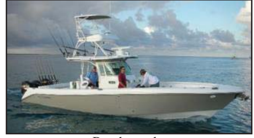
Brochure photo Actual vessel light blue