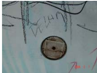
Infrared image of intra-laminate damages discovered preceeding plug confirmation of damages