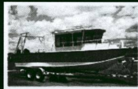
Texas A&M University