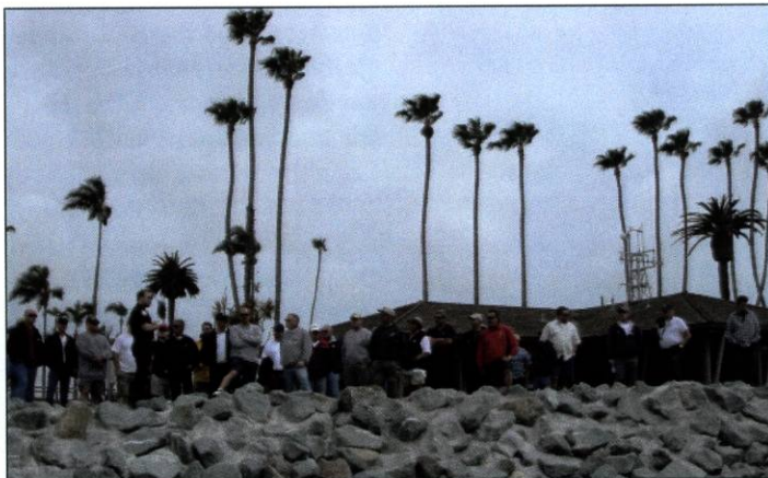
CBSOA membership viewing a dive operations demonstration at the historic San Diego Harbor Patrol Headquarters on Shelter Island during recent training.