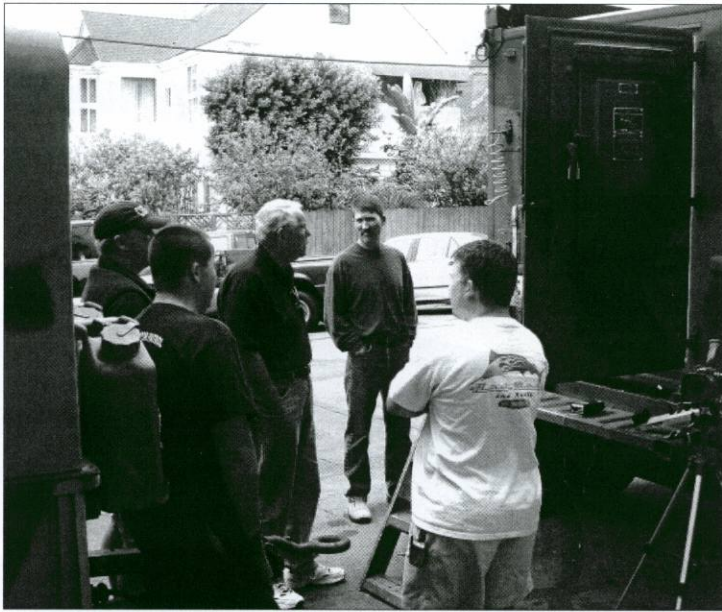
Above: Members check out the latest technology at the National Guard's Mobile Communication Center