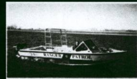
California State Parks