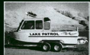
Tulare Co. Parks

1-800-722-2645 www.designconceptsboats.com 265 Boeing Avenue, Chico, CA 95973