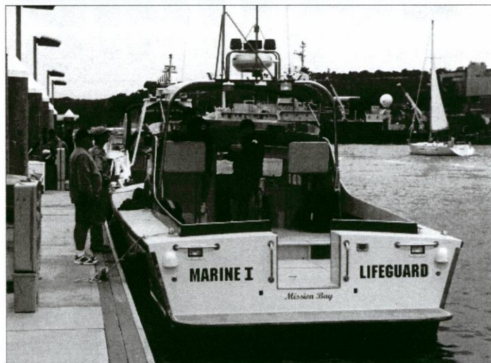
Top: members in on-the-water demonstrations with WestCoast PowerCats, SDHP, Safeboats, and other vessels. Below: San Diego Lifeguard Patrol Boat