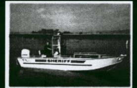
Lake Co. Sheriff